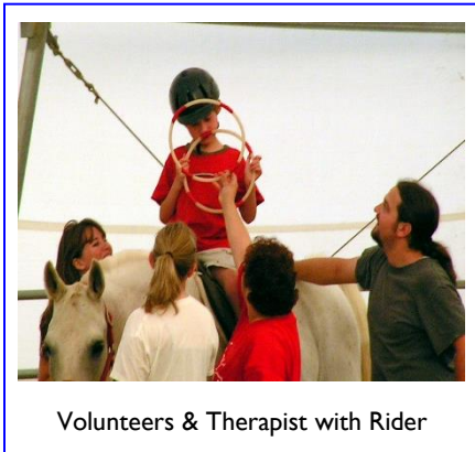
Volunteers & Therapist with Rider

A variety of community-supported activities are available to children without disabilities, from Little League and soccer teams to after-school social activities. Neurologically disabled children need opportunities to develop their physical skills and learn to interact with their peers in community-supported activities as well. Ride to Walk is one of the few opportunities these children must participate in a “special activity.” It addresses this social need while providing crucial therapy that helps their bodies and minds to develop their fullest potential. While there are a variety of programs that put disabled children on horseback for recreational purposes, Ride to Walk is one of the few programs in this area that also focuses on the therapeutic aspects of this activity.